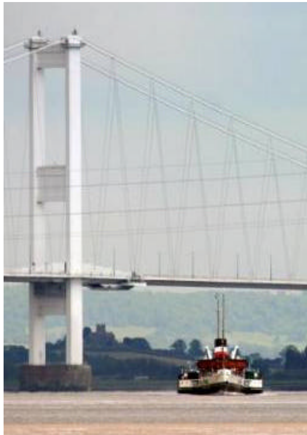
The Waverley will be used to launch the 1 st Severn Estuary Forum during the Severn Wonders Festival, June 2006

Status: Final Approved by the JAC April 2006