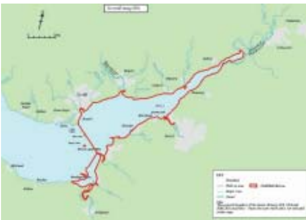
Severn Estuary Special Protection Area (SPA)

Based on Regulation 34 (1) of the Conservation (Natural Habitats & c.) Regulations 1994 and ASERA constitution.