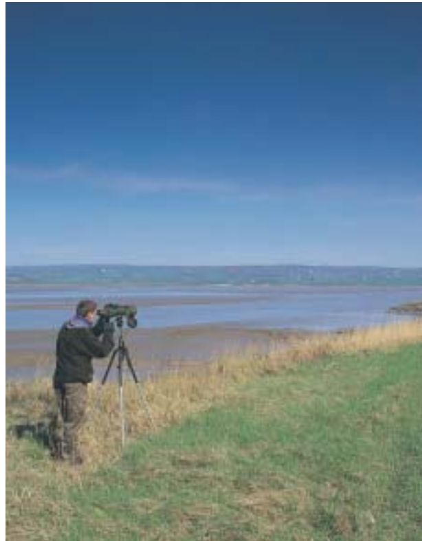
Birdwatching on upper estuary (Slimbridge)

Wherever possible, the actions identified will be based on the voluntary approach in the first instance, involving widespread co-operation and consensus between organisations. In regard to Principle 6 of the Foundation Document, additional bye-laws will only be introduced into the management scheme when voluntary approaches are insufficient, all other options have been considered, and they are the only effective solution.