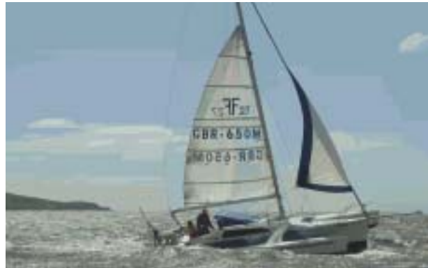
Yacht racing on the Severn

The Action Plan includes actions to be undertaken by a management scheme implementation officer. These include co-ordinating the production of framework guidance for certain