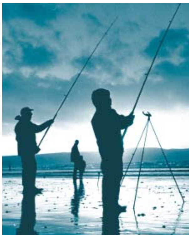
Shore angling at Weston-Super-Mare

These activities are not necessarily affecting the whole site. The timing, intensity and nature of these activities varies across the site and consequently any possible deterioration or disturbance caused by them will also vary across the site. Gathering of further information relating to these activities will help inform judgements as to their likely effects. In addition, guidance on best practice for carrying out and managing some of these activities may help to mitigate any effects they may be having.