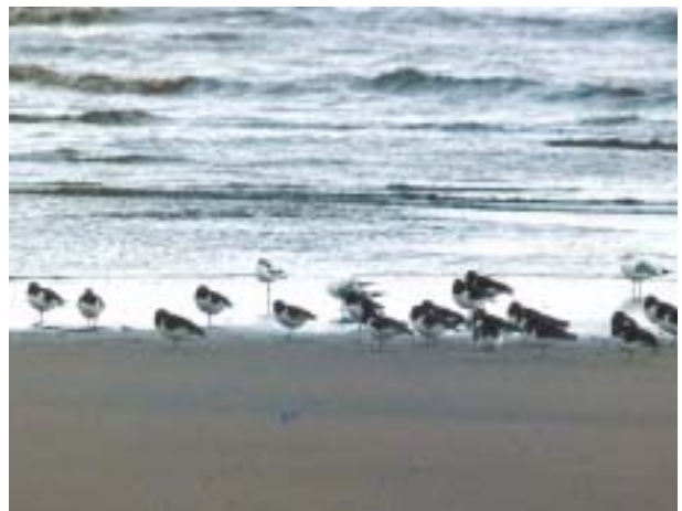
Birds on the shore