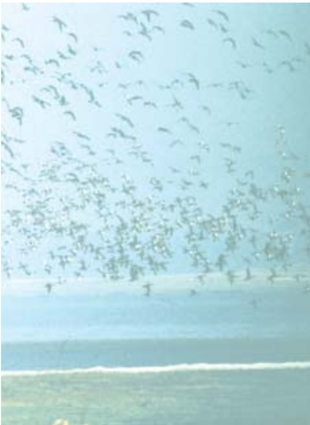
Widgeon at Bridgwater Bay

The Severn Estuary supports populations of wild birds that are of European importance, and in recognition of this the Estuary was classified as a Special Protection Area (SPA) in 1995. The Severn Estuary is also a Ramsar site and a possible Special Area of Conservation (pSAC).