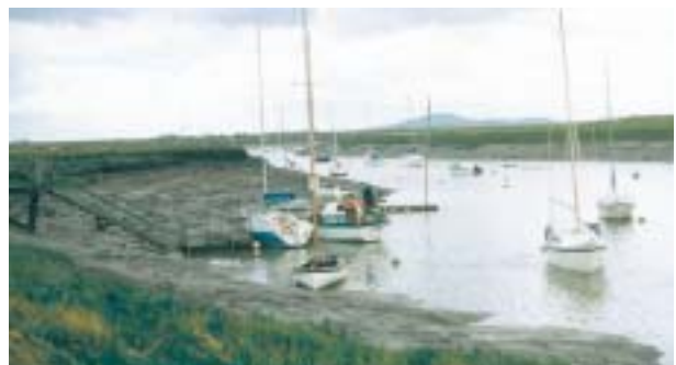
Yacht moorings on the River Axe

In certain cases when more than one relevant authority is responsible for managing an activity with a known or unknown effect on the site, or where there are gaps in management, relevant authorities have agreed to work co-operatively to address the issues. A partnership approach will be achieved by setting up topic groups, and if appropriate, Advisory Group members or other relevant organisations may be invited to participate. Discussions will then take place to determine further possible management actions and solutions.